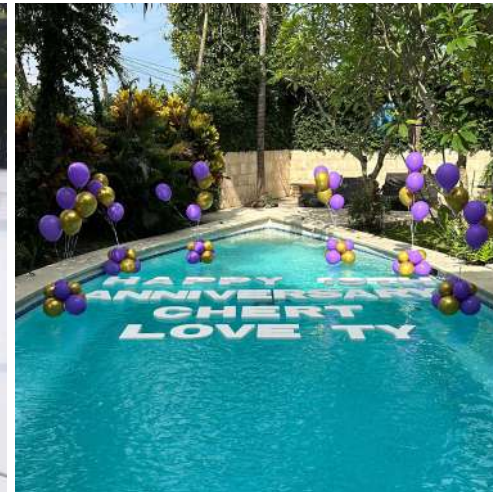
Balloon Decoration B IDR 1,700,000