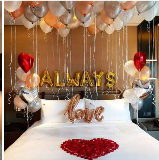
Balloon Decoration C IDR 2,000,000