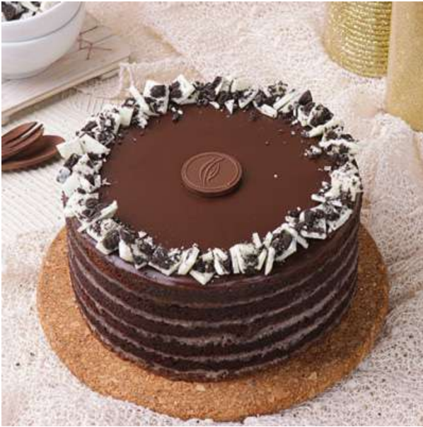
Cake IDR 350,000