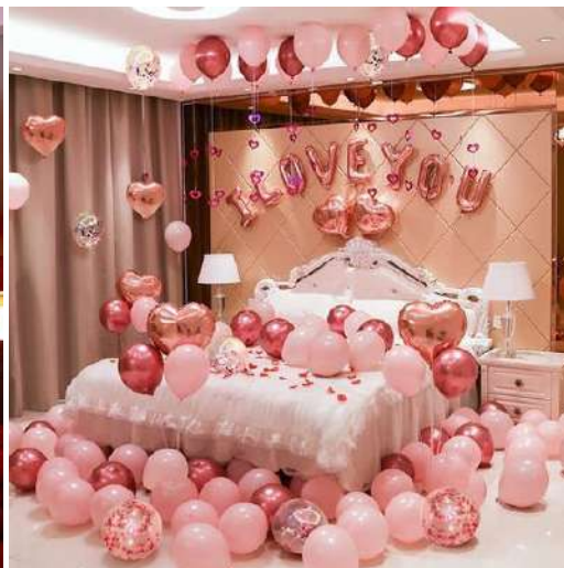
Balloon Decoration D IDR 2,500,000