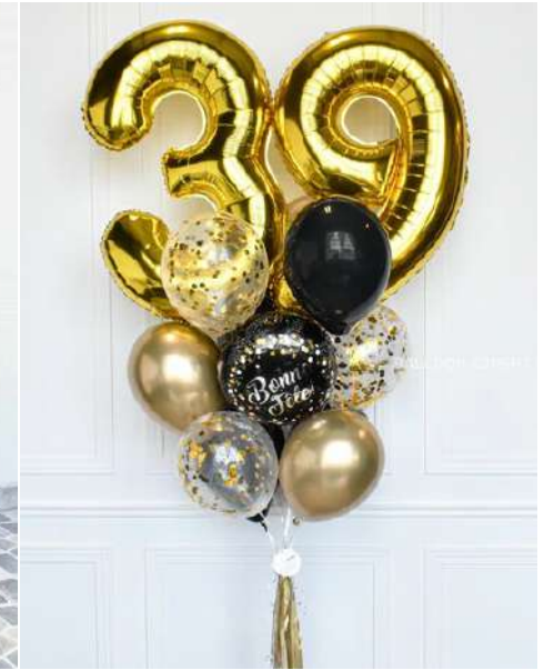
Balloon Decoration A IDR 1,000,000