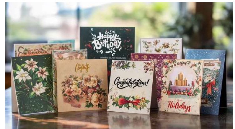
Greeting Card IDR 25,000